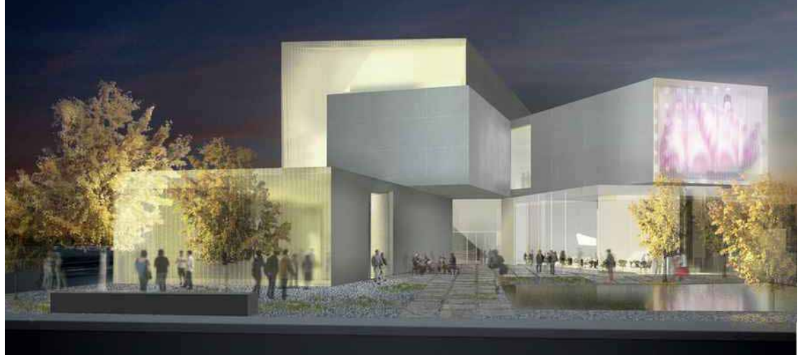
Rendering of the exterior and garden of Virginia Commonwealth University's Institute for Contemporary Art (ICA). Image courtesy of Steven Holl Architects.

June 21-23, 2018 AIA Convention New York City